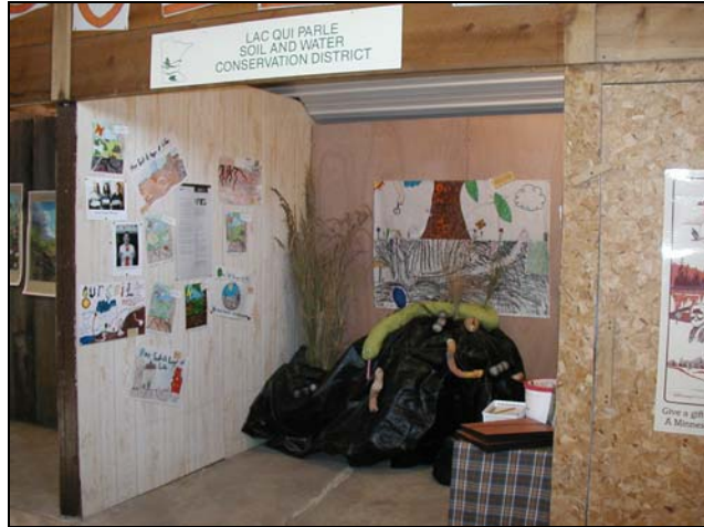
Poster and coloring contest entries illustrating Our Soil, a Layer of Life accompanied soil information and soil surveys.