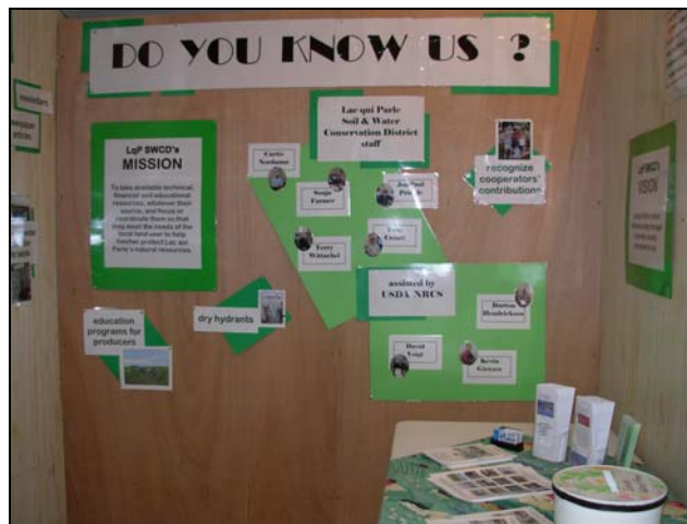
Do You Know Us? Supervisors, staff, our programs and activities